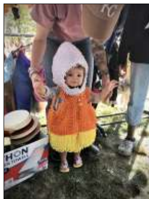
The Halloween Bootique was a wonderful opportunity for us to meet and interact with members of our community.