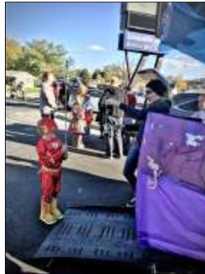
The core members loved seeing all the children at the Trunk-or-Treat.